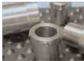
Protect small parts that may fall to the floor from chipping or marring.

Important: Most plastics will ignite and sustain flame under certain conditions. Caution is urged where any material may be exposed to open flame or heat generating equipment. Use Material Safety Data Sheets to determine auto-ignition and flashpoint temperatures of material or consult Quadrant Engineering Plastic Products. WARRANTY: Characteristics and applications for products are shown for information only and should not be viewed as recommendations for use or fitness for any particular purpose. TIVAR® and ProKnob™ are registered trademarks of the Quadrant group of companies.